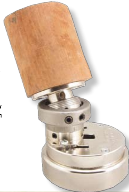
The latest version the Vicmarc-Escoulen eccentric chuck. Designed by Jean-François Escoulen, it offers an array of accessories allowing for extensive offcentre and eccentric turning

Depending on your end goal, you can turn spindles, bowls, vessels, and more with the mounting options. It is a very heavy duty implementation of eccentric workholding