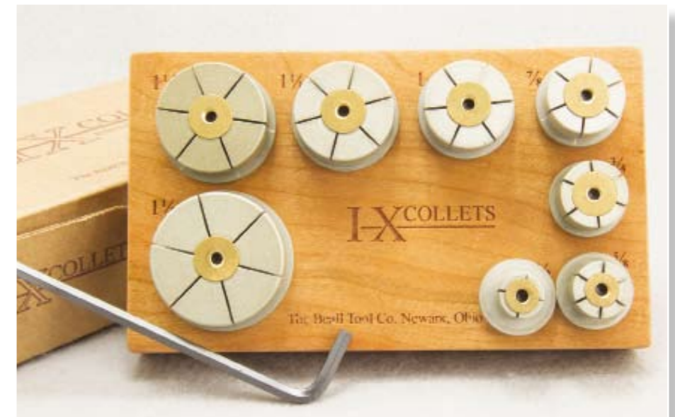
New from Beall Tool Company is a set of internally expanding (IX) collets. The eight-piece set comes packaged in a cherry ( Prunus spp. ) block in sizes from 1/2in to 1 1/2in in 3mm increments

is that the collet is fastened to the lathe so when the tailcentre needs to be removed, the mechanism is still securely attached to the lathe. With a drill chuck on a Morse taper, once the tailcentre is removed from the process, the taper is the only mechanism holding the drill chuck – and the work – in place. Speeds and feeds need to be tempered considerably with only the taper being the attachment method to prevent it from becoming loose and rattling out of the lathe taper.