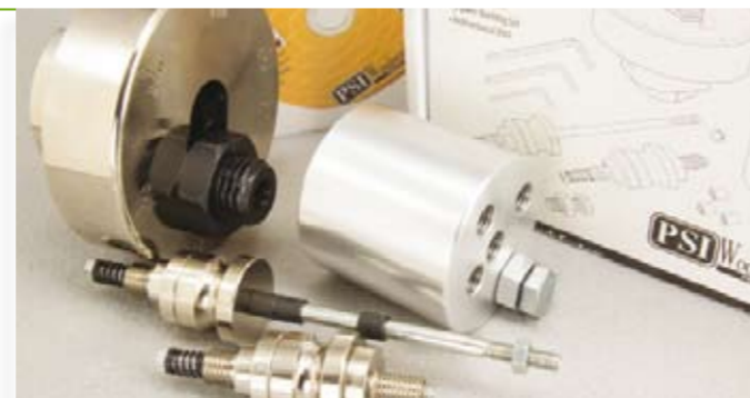
A new entry into the offcentre chuck field is by Penn State Industries. This offcentre chuck has two different mounting systems as well as a pen mandrel and bottle stopper mandrel. Each of those mandrels has an indexing system as well

A recent addition to the offcentre turning chuck market was made by Penn State Industries. Back in part seven – issue 244 – of the series, we looked at the Vermec multi-centre chuck. Both offcentre – or multi-centre if you prefer – function similarly but use different mechanics to achieve it. They are both very workable systems targeted at different price points. Taking a few moments to understand the mechanics of each will allow you to take advantage of the concept in your other workholding needs. The beauty of the Penn State system is just that, it is a system. The multi-centre chuck can be used alone but it comes with pen and bottle stopper mountings. Those mountings along with the ability to fasten a chuck or other headstock threaded device to the multi-position centre makes this multi-centre chuck a very flexible workholding device. Attractively priced and very flexible with the included accessories, it is a tool that might get you engrossed in the offcentre or multi-centre turning experience.