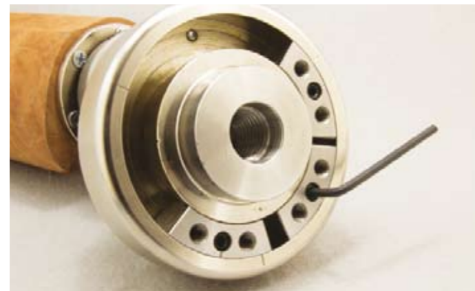
Because of the forces caused by offcentre and eccentric turning, counter balancing the weight is advantageous. The Vicmarc-Escoulen chuck has three weight blocks that can be positioned as needed for counter balancing