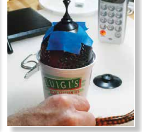
Because of its viscosity, it makes a great assembly adhesive staying where it is put until cured. It is a high strength permanent bond that is difficult to reverse