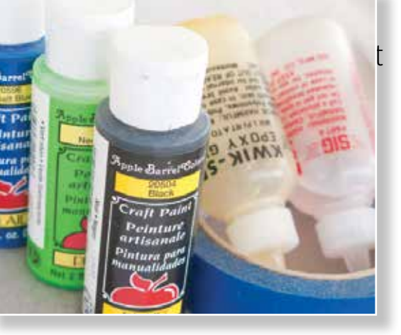
Two-part epoxies lend themselves well to colouring. Most will easily accept artist colours, pigments, wood dust or other fillers willingly with minimal property loss