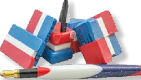
CA adhesive works nicely to bond woods and plastics together. Proper cleanliness and clamping can create a virtually invisible bond line