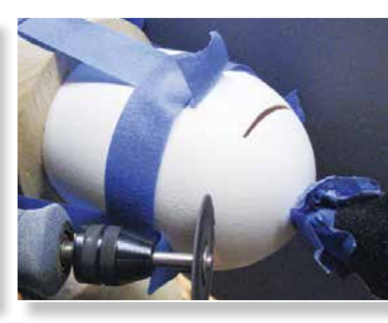
Low-tack painter's tape has a variety of applications from masking off areas for protection to padding to low strength holding needs

6. High strength fibreglass reinforced tapes are available