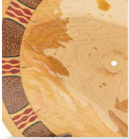
Epoxy by its nature is a great gap filler. It will impregnate end grain, provide a smooth surface coat and can even be used as a durable finish