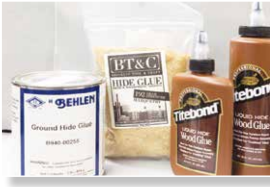
The traditional hide glue is available from a variety of sources and there is the more modern liquid hide glue available as well