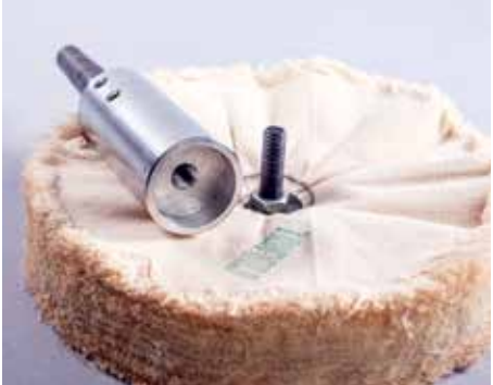
I favour the version that mounts in my lathe. The adaptor fits into the taper and provides the proper threading to receive the various buffs

The more common system among hobbyists is buffing wheels that use the lathe for their drive system. Depending on their shape, size and purpose, there are several different mounting methods. They rely on their fastening to the headstock for drive and sometimes use the tailstock for containment or shaft support. With either system, the selection of the buffing wheel material and design, buffing compounds to be used, actual rpm/buffing wheel diameter, and presentation gives the user a huge amount of control over the process.