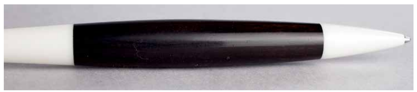
Bare wood can be buffed as can plastic. The lower portion of the Blackwood barrel is buffed only, no wax. The difference is apparent