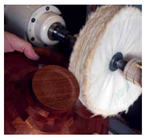
Keys to good buffing are: let the compound do the work, always work off the edges and keep the work moving

an easily closed drawer. I find that at proper buff speed, the force of presentation should slightly mushroom the face of the buff. Let the compound do the work. Always keep the work in motion as you buff. Pausing in any area may cause burning through of the finish. As you present the work and orient it so you cover all of the areas, use caution so you never present an upper edge to the buff. This raises the likelihood of a catch. To cover these areas, always buff with the wheel coming off the work with any corner coverage being faced downwards as you proceed off that edge. Recharge the buff as needed. When complete with that compound, move to the next buff and its finer compound. With multiple wheels, you simply move to the next wheel. With a single wheel setup, in a lathe for example, change to the next buff with its finer compound and repeat. Once you've progressed through the 'grits' and have arrived at your desired endpoint, the norm is to apply wax. It has its own buff