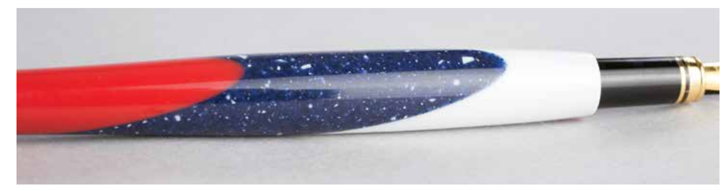
When dealing with plastics, buffing will really make them pop. This Corian - really a filled plastic - with only a quick buffing takes on a great look