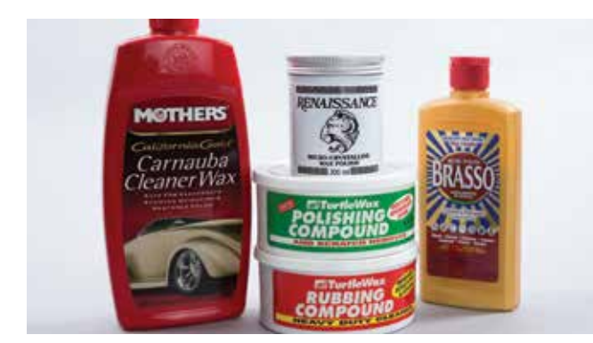
There is a huge assortment of compounds available from industrial sources. Don't be afraid to experiment with non-traditional items