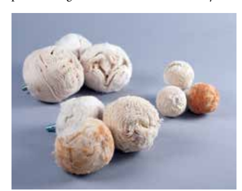
Not only are there buffing wheels but there are also different shapes to accommodate different areas and types of turnings. These are goblet buffs

Another of the variables that the turner has in their buffing process is the compound used. Many of the popular buffing systems consist of three buffing compounds along with three separate buffs. This allows each buff to be dedicated to its own compound. This is the only good way to buff with multiple compounds. Using the same buff with multiple compounds is a recipe for poor buffing results. The three commonly