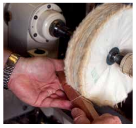
When a buff needs initial preparation or a cleanup of stray strings, the manufacturer recommends 100 grit sandpaper wrapped around a block

You've got your buffing system sorted out and have something in need of buffing. How do you go about it for best results? Be certain that you have the correct buff and compound for the first buffing. Most often, the woodturner will be using tripoli. It is the brown compound. The buff should always be rotating towards you. For lathemounted units, be certain that you always follow this. Charge the buff with your compound. Done below centre while the buff is running, a light contact of the compound to the buff moving side to side is all that is needed. Remember, less is better than more. You can recharge the wheel with compound as needed. Hold your turning firmly and present a surface away from any edges to the buffing wheel below the centreline of rotation. The work surface should be slightly tipped downwards as it is brought into contact. The amount of force used to present the work is a light amount. It is recommended as the same as closing