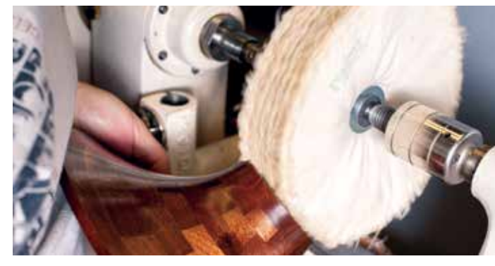
The key to good buffing is to use a mild pressure and let the compound do the work. When buffing, always keep the work moving to avoid burn through