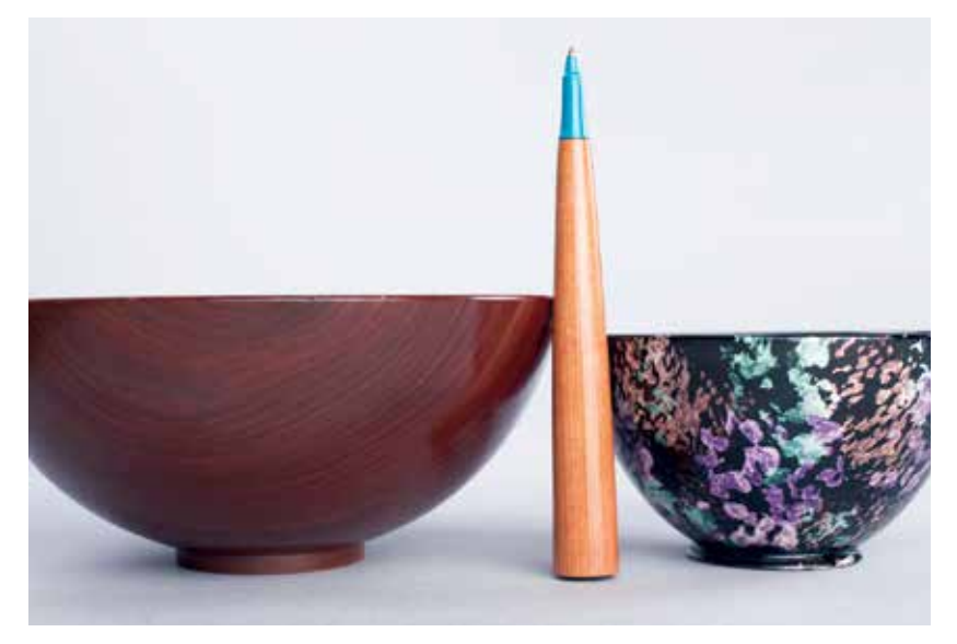
A walnut (Juglans regia) bowl made in 2001, painted bowl made in 2008 and a stick pen made in 2013 all have a fresh and vibrant look after a quick buffing only

If you aren't familiar with buffing, you probably should explore it. It can add that little extra to your turnings that may catch the potential customer's eye. It is a simple process that is relatively low cost with few rules. I find that any of the hard, dense, fine-grained woods will take on a look as if they had a finish applied. The gloss that can be created does set them apart. Every plastic that I have buffed with the appropriate rouge has had a clearly noticeable improvement. The turnings that have a finish applied are also markedly improved in appearance with proper buffing. The time required is minimal for the benefit provided. If you are new to buffing, do take the time to create a few practice pieces with your woods of choice and typical finish rather than learn buffing on one of your masterpieces. The time invested in making them and then buffing them to your satisfaction will certainly be a wise investment. Once you've got a taste of buffing, I'm quite certain you will be buffing most if not all of your work.