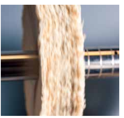
It is far too easy to run the buff too fast. The buff should still be fluffy and floppy when running at speed. If it narrows in width appreciably, it is too fast

There are four independent control knobs to your buffing. The first and often the most misused is the buff rpm. In reality, it is surface feet per minute of the buff past your work that matters but for now we'll speak to the rpm portion of the equation. For the fixed motor, you'll often be stuck with the motor rpm but do have buff diameter to have some impact. With a lathe-mounted system, you'll have either the fixed pulley speeds or the variable speed controls of the lathe to set rpm. There are two impacts of rpm. The first is the stiffness of the buff. The higher the rpm, the stiffer the buff. How stiff you make the buff