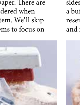
There are interchangeable buff buffing systems available for the single and double end shafted fractional horsepower motors

Buffing, other than the application of wax, is a sanding process. Usually a very fine sanding process but sanding none the less. The buff, usually a multi-layer assembly of soft material, becomes the carrier for the abrasive. You charge the buff with your buffing compound. That compound is really an abrasive turning the buffing wheel into a rotary piece of sandpaper. There are several items that are considered when setting up your buffing system. We'll skip the hand-held buffing systems to focus on