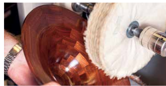
Even older work can be refreshed with buffing. This segmented bowl made back in 2006 gets a buffing that brings it back to life

Buffing can be done to bare wood. Since it is a cutting process, although very fine, it can help bring a glossy finish to denser woods. You would buff your unfinished wood at the completion of turning and sanding. The buffing is simply an extended sanding routine. You can also buff your plastic turnings to improve on their appearance. Plastics usually don't start with the coarser tripoli and white diamond but will use more of the blue rouges and other jewellery compounds. That really depends on how far you've taken your sanding and MicroMesh routines. If you have applied finish to your turning, you must wait until the finish has cured hard. I mean really hard. You will mess your finish up if you begin buffing it before the finish has cured. You can end up with either a gummy kind of mess or hazing the finish. If you have any doubts as to whether you've waited long enough, wait longer. If you need to hurry because of an impending show or sale, I recommend you