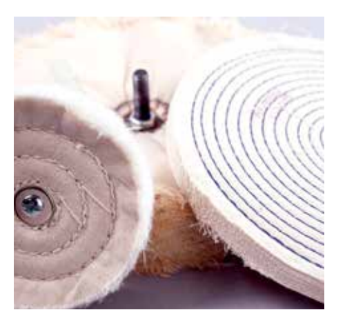
Buffs are available in different materials, diameters and rigidities. By stitching the buff, the pattern and nearness to edge controls the stiffness

will impact the way it buffs. Faster makes it less deflective and more aggressive from the cutting standpoint. The other impact rpm has is the actual rate at which the buff material is presented. It is all about surface feet per minute. A 200mm buff on a 3,500rpm motor will not only be very stiff but will also present a huge amount of wheel length to the turning per unit time. A 100mm buff on a 1,725rpm motor will provide a far less stiff buff but also much less distance of wheel to the turning per unit time. Often, fixed speed motors will drive a pulley system that alters the rpm to buffs mounted to a separate shaft. You see