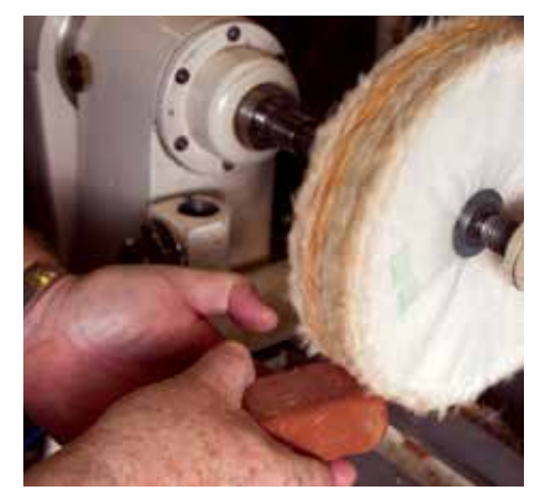
Charging and recharging the wheel with buffing compound is a simple task. Done below centre with an easy touch, the wheel is lightly loaded for use

You've got your buffing system sorted out and have something in need of buffing. How do you go about it for best results? Be certain that you have the correct buff and compound for the first buffing. Most often, the woodturner will be using tripoli. It is the brown compound. The buff should always be rotating towards you. For lathemounted units, be certain that you always follow this. Charge the buff with your compound. Done below centre while the buff is running, a light contact of the compound to the buff moving side to side is all that is needed. Remember, less is better than more. You can recharge the wheel with compound as needed. Hold your turning firmly and present a surface away from any edges to the buffing wheel below the centreline of rotation. The work surface should be slightly tipped downwards as it is brought into contact. The amount of force used to present the work is a light amount. It is recommended as the same as closing