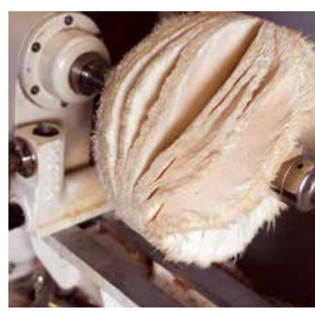
Whether stitched or not, the typical buff is constructed of many thin plies of cloth. There is an assortment of materials available

There are four independent control knobs to your buffing. The first and often the most misused is the buff rpm. In reality, it is surface feet per minute of the buff past your work that matters but for now we'll speak to the rpm portion of the equation. For the fixed motor, you'll often be stuck with the motor rpm but do have buff diameter to have some impact. With a lathe-mounted system, you'll have either the fixed pulley speeds or the variable speed controls of the lathe to set rpm. There are two impacts of rpm. The first is the stiffness of the buff. The higher the rpm, the stiffer the buff. How stiff you make the buff