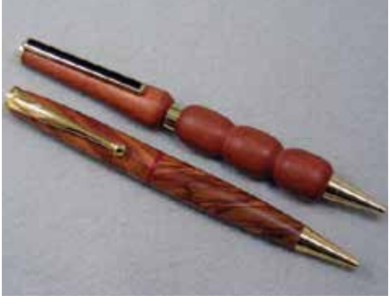
A 7mm kit with no centre band is just a bit shorter. Not really a problem in most cases