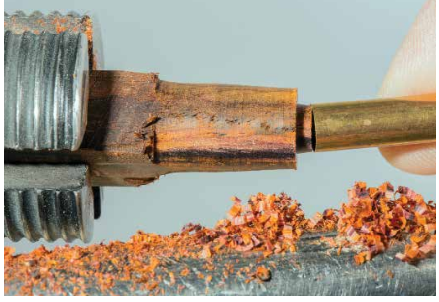
Use a brass tube to size your shaft on your end cap. Quick, easy, and no measurement errors

Once you've turned about an inch in length to this slip fit, cut the corner between this shaft and the remaining