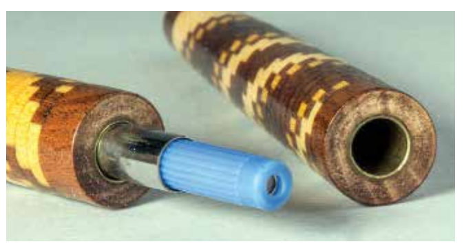
When the situation dictates, you can also insert another brass tube and trim as needed