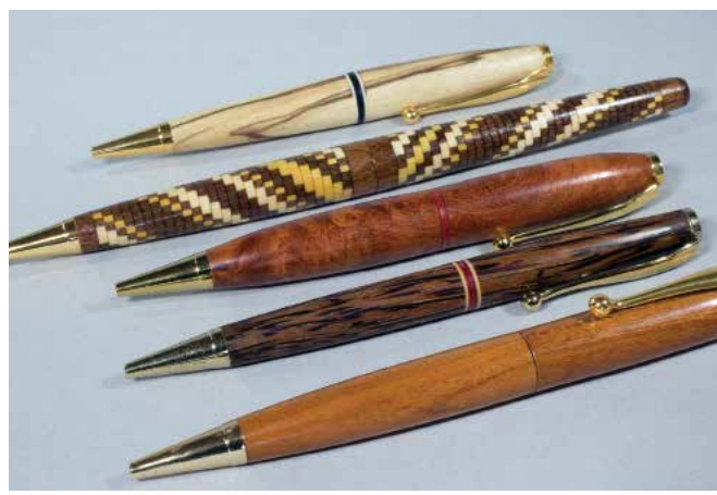
Being freed of the centre band constraints opens a whole world of sizes and shapes