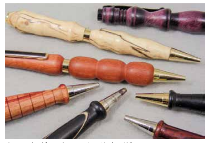
The centre band forces the user to 'meet' in the middle. To overcome, wild shapes are created

that it brings. Having dimensional requirements on both ends of the pen barrels for the press fits is constraining enough. Forcing you to neck down to meet the centre band dimensions tends to create some bizarre and ugly pens. To overcome this shape and dimensional constraint, many try including beads and coves, ridges, and more. Eliminate the centre band altogether.