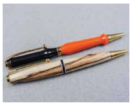
You can easily make up this missing dimension by inserting trim colours on the barrel ends