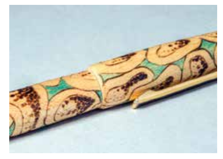
Another method of mating barrels with missing centre bands is to create a small overlap