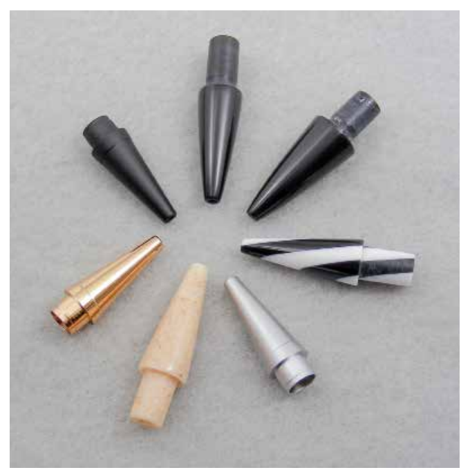
Because of the thin wall needed for nibs, materials with no grain, such as plastic, work well

own nibs or end caps, you will not be able to hard press them into place as you would with the kit-supplied brass parts, unless you make them from metal. You'll glue them into place. This is not difficult at all but it does require a change in the assembly process. You can now make the nib end or clip end to the original dimension or any diameter you want. You now have total freedom in length, shape and diameter at both ends and the middle.