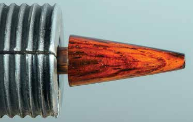
Sand through the grits until you are content with the shape and finish. Again, I use a CA finish