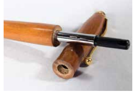
The choice to make up the missing dimension in one barrel or both will be yours