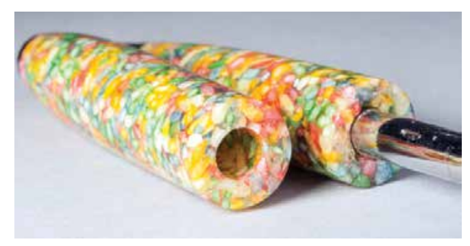
You can make up any missing length by leaving some of the interface barrels unsupported by brass