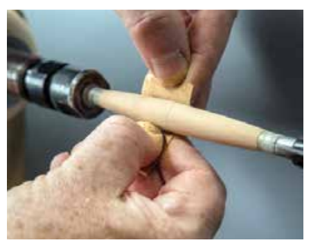
Butting the two barrels together makes it easy to have them fit perfectly since you create them simultaneously