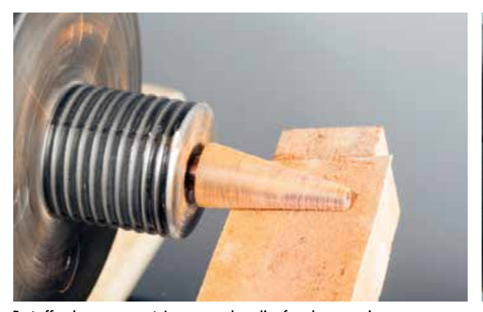
Part off and reverse mount. I recommend sanding from here on using a backing board