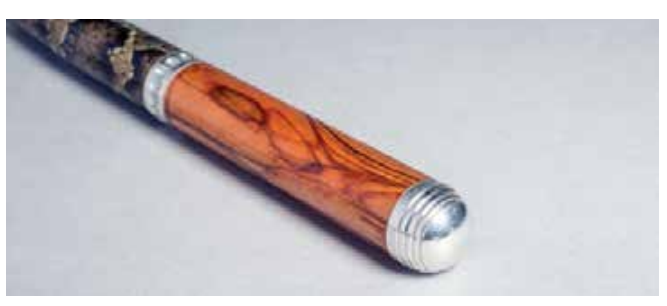
As metal is easily turned on your lathe, aluminium can be made into caps, nibs, and trim