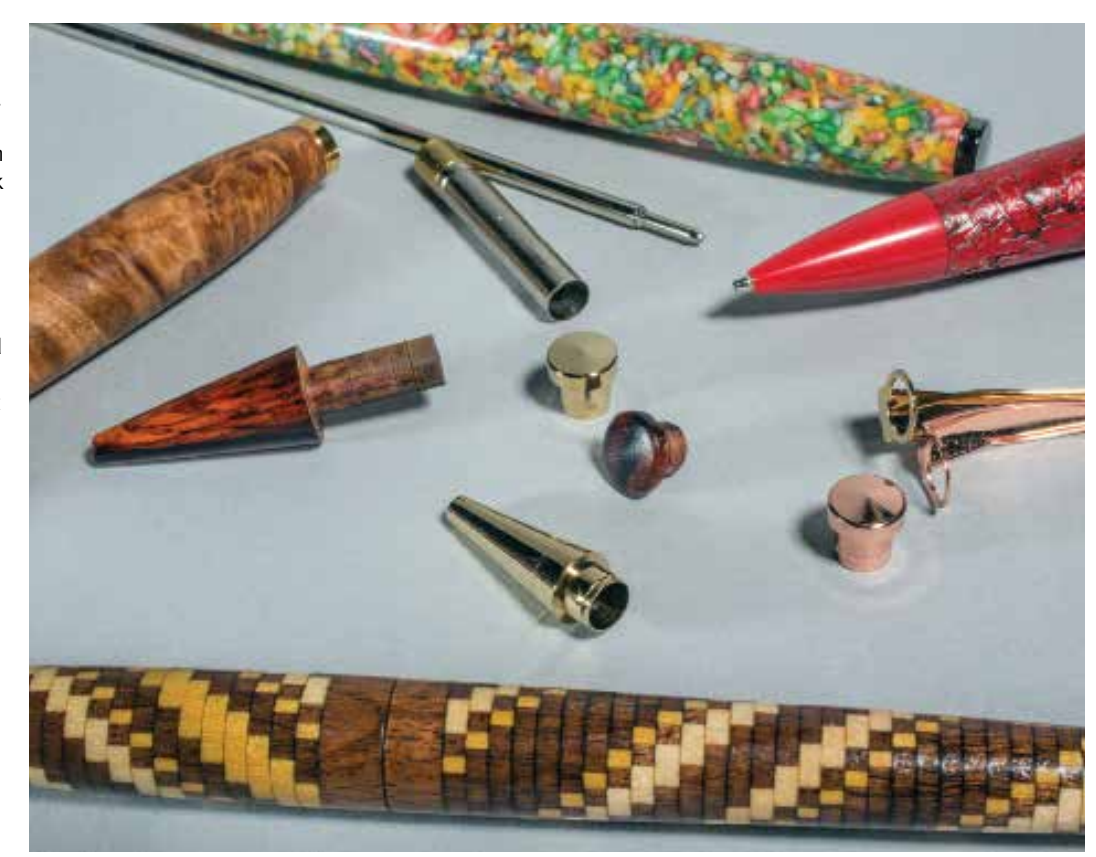
Loosing the centre band and creating your own parts can make the 7mm kit hugely versatile

The 7mm kit is a wonderful starting point for the pen turner. It is modestly priced, simple to make, and is designed for a high success rate. It is often the hook into woodturning. Once the hook is set, move on to bigger and more challenging things. Taking the 7mm kit and using the adaptations suggested is only the start. Ideas not covered yet are the creation of custom clips, elimination of all of the kit parts except the ink-fill, exotic blank designs and creations, and more. Use the ideas here to expand your horizons. Each of these ideas lends itself to a host of personalisation ideas. You can continue on with exploring the modifications of the 7mm kit for quite some time before you run out of ideas. Long before that, I'm certain you'll have moved into other kits with these changes. Those, along with materials exploration and presentation ideas, should keep you challenged for quite a while.