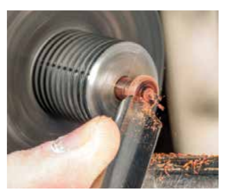
Shape your end cap as you wish. A rounded edge will be less prone to dinging and damage