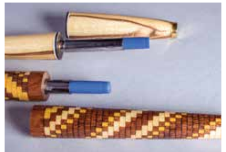
Press depth is very forgiving with the 7mm kit. As long as the brass portion of the transmission seats, all is OK