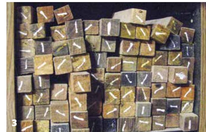
3 For example, while not labelled or in any real organisation, easy and quick location of one cubby of undyed, stabilised blanks allows for easy choosing

How do you store your woods? Different for wet vs dry? If I store outside, what do I need to do to provide the best storage?