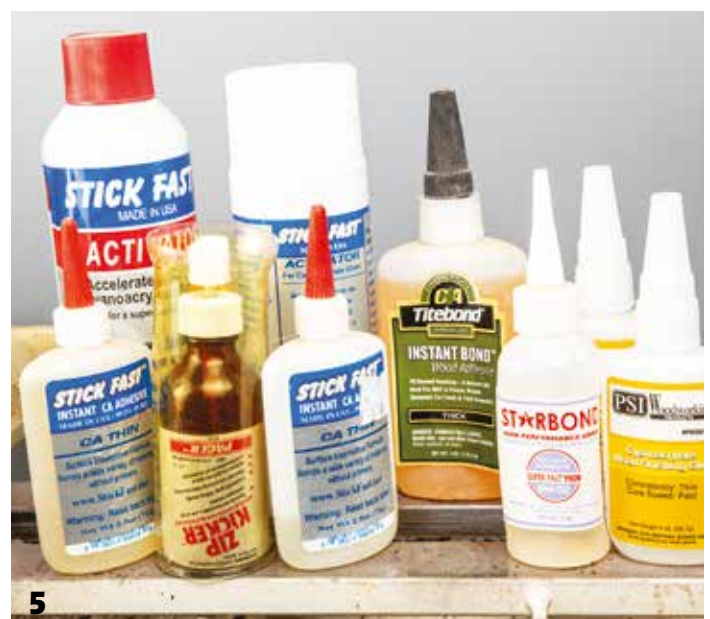
4 The AAW has a great vetting system for woodturning videos and a 35-year deep archive of the AAW Journal contents available to members. Both are great resources 5 No brand endorsement intended, these are the CA and accelerators in my shop today. I've used many different brands and find all quality brands work well when used properly