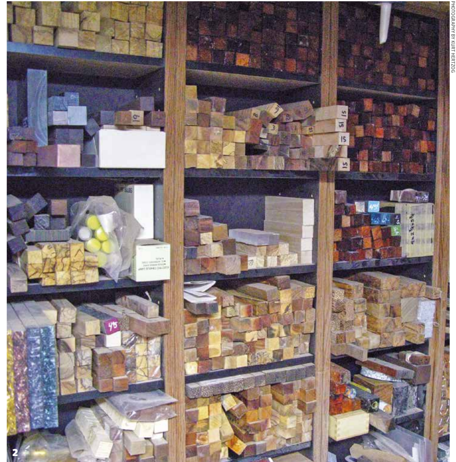
2 Just part of the wall of CD racks stacked on top of end-to-end workbenches illustrates easy storage of a large quantity but also quick visual location

limited to the bead size of that particular tool unless you have additional differently sized tools. Beads, typically on spindles, are cut into face grain – not the best way to create a cleanly cut and crisp feature. I own beading tools and do use them. I do try to cut my beads whenever I can because I find the results superior when I'm successful. My beading tools find the most use when there are many beads that I really want uniform. The tools I'm familiar with from various manufacturers all work well. If you buy from any of the quality houses, you'll do fine. Regardless of your goals in woodturning, I'd suggest that you strive to master cutting beads. No need to aggravate yourself with a skew if you aren't at an adequate proficiency with that tool. The skew certainly is a tool to master but a spindle gouge, properly sharpened and used, will do a fine job. My suggestion really has little to do with beads. It is solely using beads as a milestone in your tool control skills. Your ability to cut beads, whether skew or spindle gouge, adds to your repertoire of skills that find use in all of your turnings.