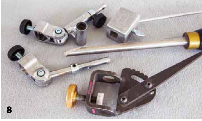
4 One of my go-to woodturning sites is the World of Woodturners (WOW). Approaching its 20th anniversary, it is well run, focused on turning, and avoids carping about other issues 5 The WOW site has plenty to keep you engaged. It has a calendar, file cabinet of articles, a photo library (collective and individual member), and relevant discussions 6 My main shop grinder, and my lighter-weight travelling grinders, are equipped with large, solid toolrests, along with the Oneway Wolverine jig fittings 7 While I freehand all my scrapers and nearly all of my cutters, I use the Wolverine Grinding jig system for those special angled tools 8 My Ellsworth gouge jigs for the Wolverine Grinding system and my Tormek. They give me a repeatable, easily obtained, properly shaped and sharpened gouge.