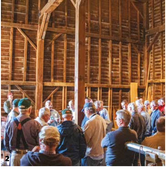
1 Examine items of interest before you get involved with bidding. Whether online or in person, know what the tools, equipment, or materials are worth to you and set your maximum bid 2 Auctions are a lot of fun. Be cautious as it is easy to get wrapped up in the excitement of bidding and wind up paying too much to win your item(s)

It the tools are of a quality name you would buy at retail and aren't excessively worn or damaged, 50% of retail is a typical used-tool price, regardless of where you might buy them. At auction, you can often do far better than that typical resale price - it depends on who else is bidding, how much they know about the item, or if they really want it. On occasion, you can cherry pick item(s) from a multi-piece lot someone else has won. If that winner is not interested in all the items, you can make an offer to buy the pieces you desire and they recover part of their purchase price and get rid of something in the lot they don't specifically need or want. But don't bank on selling and recovering monies by unloading unwanted items in multi-piece lots if you win. Bid on lots with items you want or need. If unwanted items are included, price them at zero or some minimum value. Set your maximum bid based on your desired items. You may wind up storing won but unwanted included items until they go to the bin. At least you haven't paid (much?) for them. Auctions are great fun and can be a money saver, provided you participate wisely and don't get swept away by the must-win fever.