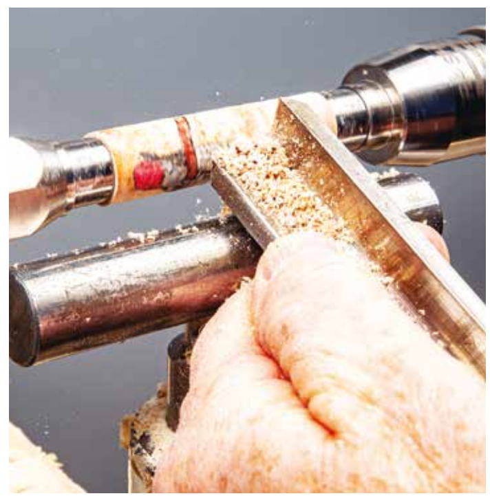
3 Much of my shop time is spent taking photos. Setting up the strobes and camera appropriately, pre-focusing, turning to the correct explanation point, and capturing each image takes time