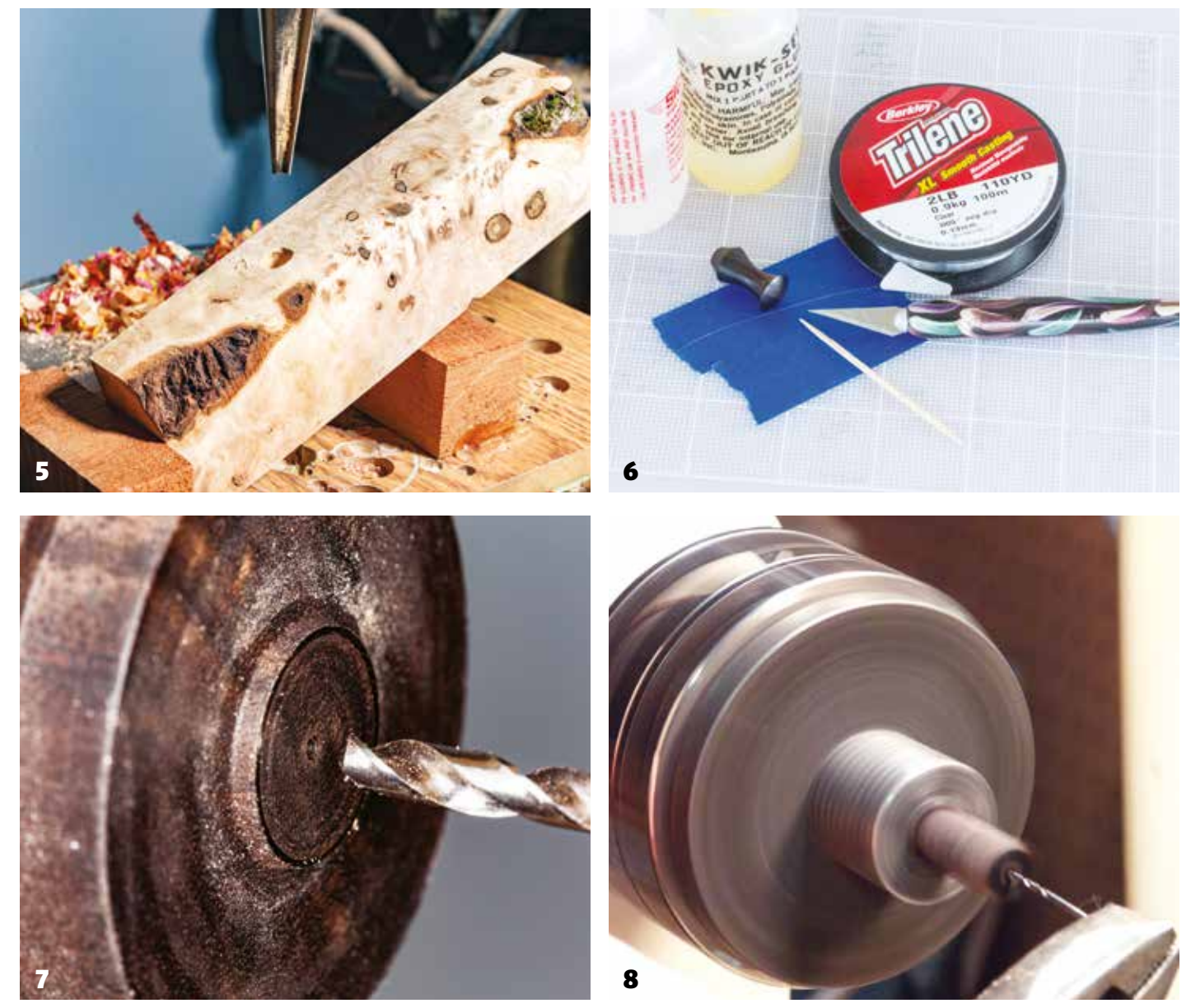
5 It is key that a starter location be created for any off-perpendicular drilling. A starter location is critical for safety and success 6 Holes for a double strand of 2 or 4lb. test fish line are in the .038in arena. You can break a lot of small drills if you don't work carefully 7 Even a perpendicular, flat surface benefits from a starter drill location. Only taking moments, this 1/sin drill will have no location or starting issues 8 With a good starter drill location, a sharp drill allowed to do the work can be hand held to drill small holes quickly.

or parting tool to cut a small V-pocket at the centre of rotation. I recommend using a starter drill. These drills, from the machining industry, are stubby tools designed specifically for this purpose. By design, they are virtually impervious to flexing. Use one of these to drill a starting hole, giving your following drill the desired dimension to have a precise and no-wander place to start its process. With an effective starting location cut in one of those three manners, you can drill your hole without wander. Regardless of your starting location technique, good practices of drilling techniques, speeds, and feeds will be needed to drill a quality hole with minimal drill breakage. Obviously, small diameter drills need to be handled gingerly. Advance carefully, slip into the starting location, and let the drill do the work. Breaking the chip and retracting to clear the flutes is often necessary. Any muscling of the process usually breaks drills, often partway through the process. Then you'll have a broken drill to remove too.