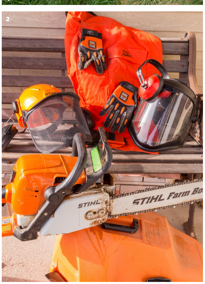
1 My stable of chain saws. Since I don't tackle very large work, my Stihl is large and powerful enough for my needs. The others fill the smaller and quicker cutting or indoor cutting. 2 As important as the saw and your training is your PPE. Here's mine. Protective helmet (face and ears too), chaps, gloves, and extra PPE for the non-cutting helper if needed.

comfortable with, but I use a combination hard hat helmet with a wire mesh face mask and integral earmuffs. Along with my head, face, and ear protection, I have a pair of chain saw chaps and jacket, and cut resistant, vibration dampening gloves. It all stores nicely in a duffle bag next to the saw. Some advice wanted or not. Buy for value and not for price if you can swing it. The big box stores are unable to help you with any saw problems. Buying from a dealer who carries the more professional saw products, while pricier, will pay dividends when you have any issues. I have never been unhappy with my local Stihl dealer. That said, I have friends who run professional tree services that use other pro brands and are happy with them. The usable lifetime on my saws is far longer than on me so spending a few extra bucks was worthwhile. Take your time and spend your money to wisely get what fits your needs and has support.