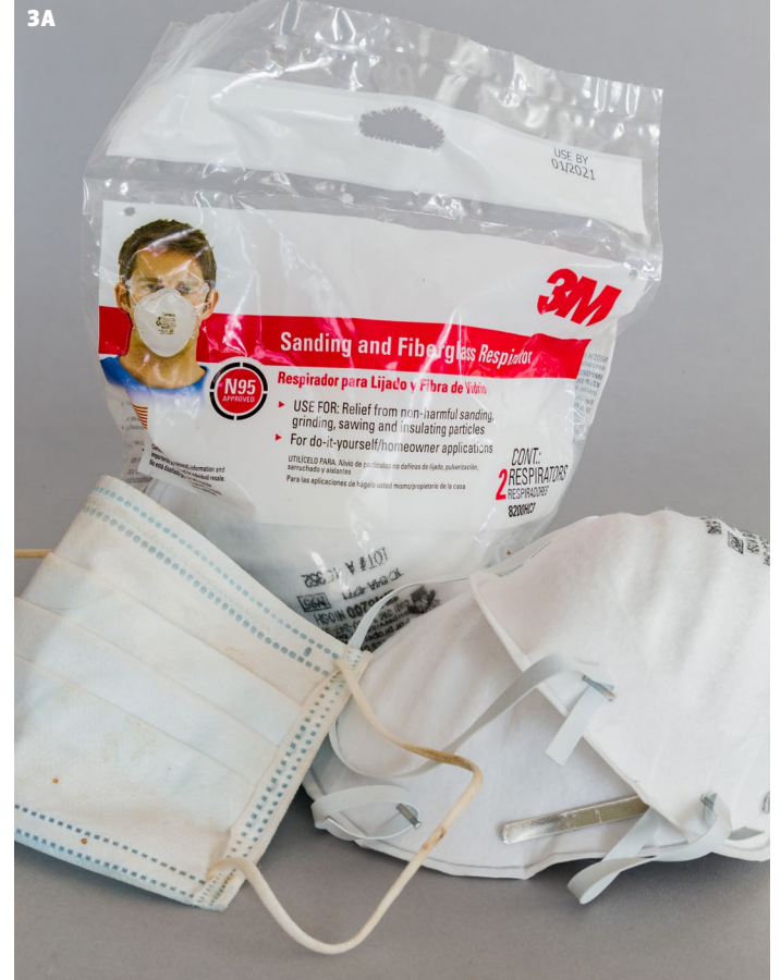
3 There are times when a dust mask is a wise idea. I keep some dust masks in my duffle bag for those occasions. Small, lightweight, and inexpensive protection when needed. 4 I always have room for extra PPE for those onlookers that are only in need of ear protection. Even far away to be safe from debris, is still close enough for too much noise.

comfortable with, but I use a combination hard hat helmet with a wire mesh face mask and integral earmuffs. Along with my head, face, and ear protection, I have a pair of chain saw chaps and jacket, and cut resistant, vibration dampening gloves. It all stores nicely in a duffle bag next to the saw. Some advice wanted or not. Buy for value and not for price if you can swing it. The big box stores are unable to help you with any saw problems. Buying from a dealer who carries the more professional saw products, while pricier, will pay dividends when you have any issues. I have never been unhappy with my local Stihl dealer. That said, I have friends who run professional tree services that use other pro brands and are happy with them. The usable lifetime on my saws is far longer than on me so spending a few extra bucks was worthwhile. Take your time and spend your money to wisely get what fits your needs and has support.