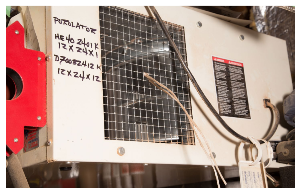
5 While not flowing at the highest flow rate, there is still some life in the filters. When it drops a bit more, it is time to vacuum the front filter (or replace) and replace the inner filter.

share how I do it. To tell when the filters need attention, I check the actual airflow. A trick I learned many years ago was to tie some strings to the exhaust screen. When the strings blow out horizontal, the airflow through the filter system is very good. As they tend to droop from horizontal, your airflow is somewhat restricted. When the exhaust airflow strings dangle down too far, it's time to change the filters. I do two things with my filters. My outer filter gets a vacuuming from my floor based, multi-horse dust collector. I can clean out the filter in a flash with the vacuum hose and press it back into service. This will work a few times before it needs to be replaced. The inner filter gets trashed and replaced each time