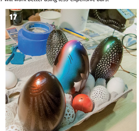
16 The beauty of a die grinder is working with thicker woods and the ability to colour the inside of the pierced holes with a slight burn 17 Painting in process. Experimenting with some automotive candy colours in the workshop of the late Giles Gilson.