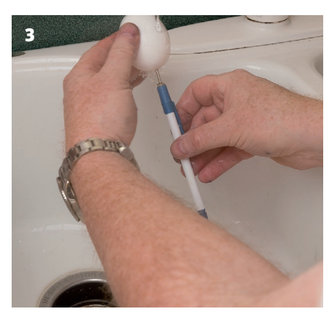
1 Getting into using eggs can be as easy as a trip to the supermarket. Different sizes and colours can make things very interesting 2 My process is to warm up the eggs, pierce a hole in the centre of the top of the shell, and break the yolk. The insides are now removable through a relatively small hole 3 Injecting air into the inverted shell will blow out the contents. Rinsing with water or bleach cleans the inside. That is ejected using the same method.