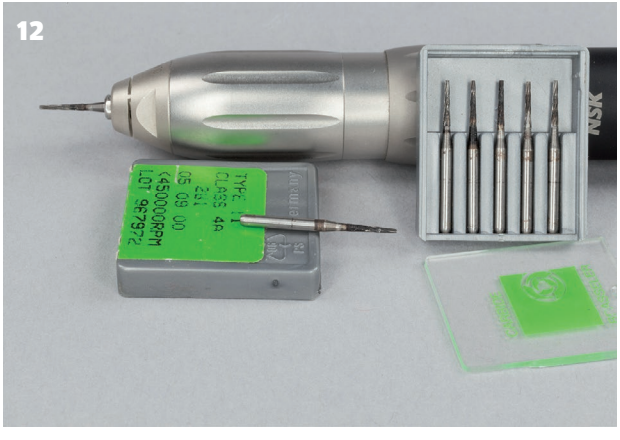
10 Piercing eggshells works best with ultra high-speed rotary tools. My eggers are the TurboCarver and the NSK Presto. The lower-speed die grinder has more torque for wood 11 Not all die grinders are equal in performance and rpm. The good, better, and best in my die grinder kit 12 If you get into high-speed piercing, be certain your carbide burs are rated for that speed. Notice the rpm rating on the burs is up to 450,000 rpm.