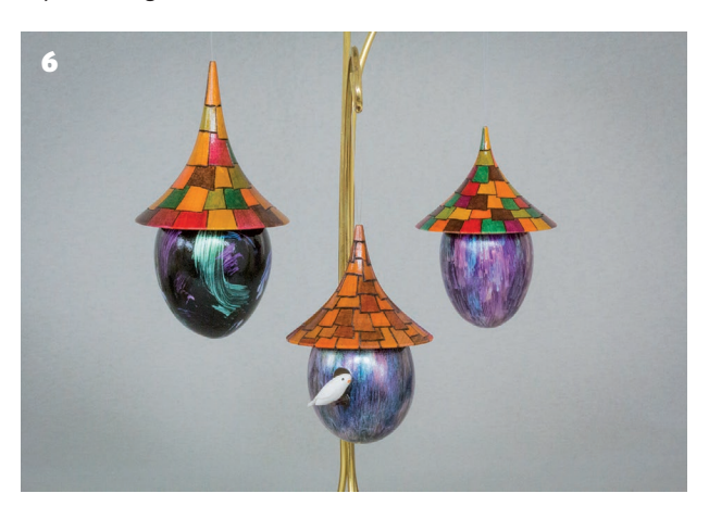
4 Any stains on the shell will impact the results, whether painting or dyeing. I 'drip dry' my freshly washed shells on a homemade bed of nails 5 Emptied and cleaned eggs are easily painted to any colour. Craft store appliques and a couple of finials make a quick and easy ornament 6 Eggshells lend themselves to a variety of ornament designs. One of my favourites is the proverbial birdhouse with a colourful thatched roof.