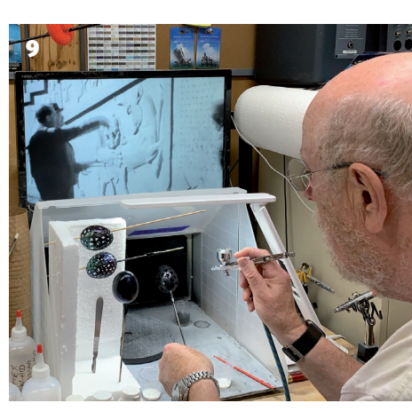
7 One of the things I like the most about eggshells is the pleasing shape and their ultra-light weight – they lend themselves to dainty creations 8 Even with dust extraction, I always wear a dust mask unless I'm outdoors with a breeze. Eggshell dust should be treated like wood dust – use proper PPE 9 Eggshells, pierced or not, can be easily painted by airbrush, rattle cans, and even with brushes.

simply adds weight. They do require reasonable handling, both during the piercing process and afterwards, but reinforcing isn't required. I haven't had any problem with breakage while handling and piercing. I have had breakage with impact moving them around or storing them afterwards. The breakage of the eggshells and ornaments is always after the fact, with inexperienced people handling them or accidental breakage while being dusted or moved by others.