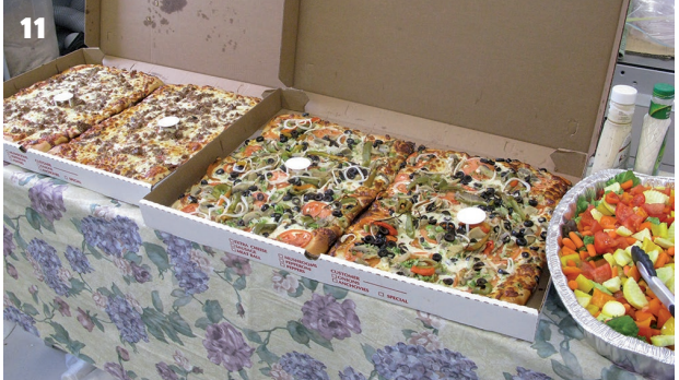
9 Do you think the neighbours know that a gaggle of turners have showed up for some fun? Again, part of your planning is obviously parking as well as turning space and electricity 10 Natural light and plenty of space makes this offsite turning spot wonderful. Easy to set up, use, clean up, make this one of my favourite spots 11 Remember the part about how hungry turners can get over the course of an afternoon. Pizza is one of our favourites. Notice the healthy food too

Let's imagine you have access to a large barn or other site that doesn't require renting or reserving. Using a place that a club member owns changes the situation, but not much. You still should be certain you have liability coverage of some kind. It might be the home owner's, the club chapter insurance, or bought for-the-day insurance. You have more flexibility in the dates for your event, repeating it such as every Saturday during June, or what suits your group. Great ways to get the entire club involved. Obviously, the equipment set-up and tear-down require vehicles, electrical hookup, tools, grinders, PPE, etc. You can involve the non-turners with clean-up, food prep, snack area operation, your lending library, and general cheering on of the participants.