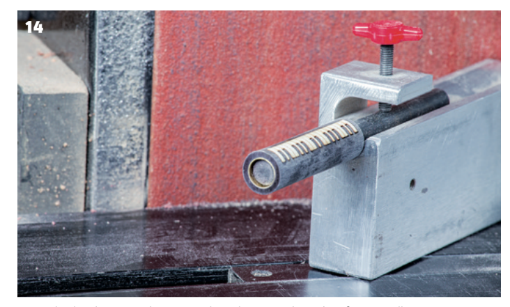
14 Whether homemade or store bought, a good sanding fixture will support the blank to almost the very end, allowing for accurate results

I have recently been using the barrel trimmers designed with the replaceable carbide cutters. While more costly than the traditional barrel trimmers, whether steel or carbide, they work superbly. I'm extremely impressed with the family of interchangeable pilots that allow the trimmer to be used on just about any tube diameter available. The replaceable cutters allow you to rotate a virgin edge into place whenever the need arises.