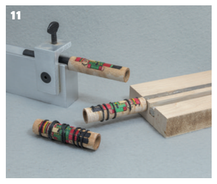
3 Part of my stable of barrel trimmers. I modify them based on my needs and often use tape to create a low-tech bushing for a good fit inside the brass tube 4 Reasonable speeds and feeds will help maintain the life of a barrel trimmer. It is easy to overheat them and ruin any finer cutting capabilities 5 The goal of a barrel trimmer is to trim the wood flush with the brass tube. Good placement and gluing will help to minimise the amount needing to be trimmed 6 If you don't have a set of modestly priced diamond hones in your kit, I suggest you add them. Ideal for touching up barrel trimmers, skews, parting tools, bedans, and others 7 Exactly the WRONG way to touch up a barrel trimmer. Do you think you can touch up all four edges remaining at the correct angle and keep all edges coplanar? 8 Far easier to touch up the cutting edges, remaining in contact, and maintaining coplanarity of the cutters. Like tools, keeping them sharp is easier than sharpening 9 A recently released barrel trimmer family. A single cutter head with two carbide cutters mounted accepts any one of the pilot diameters available in the kit 10 My favourite feature is the amount of 'overhang' the cutter has with the brass tube. This prevents the brass tube from creeping between the cutter and the pilot 11 If you trim laser cut kits, a barrel trimmer usually breaks things. Having a fixture to pilot the blank on the brass tube ID works great, whether homemade or store bought