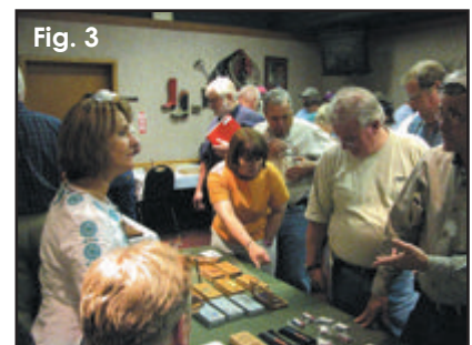
Some of the over one hundred attendees at the Rendezvous.