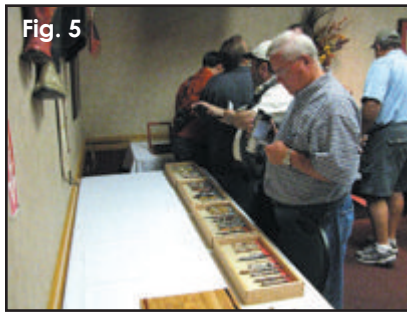
Fig. 5 People voted for their favorite pens in several different categories.