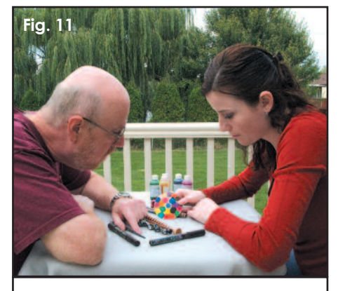
Someone else's abilities can help you in areas where you may be weaker; my daughter helps her color-challenaed father make some coloring decisions.

One of the most underutilized inspirational opportunities, in my opinion, is collaboration. No one has all the answers or all the best ideas, and sharing ideas and collaborating with another turner-or better yet, an artist from a different discipline—can produce exceptional results. Capitalize on another person's expertise to supple-