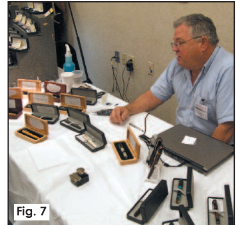
Juried shows or high-end pen shows will show where you stand with respect to your peers.

What about shows or entering competitions (see Fig. 7)? Not to be done for the prize or ribbon, but to see how you really stack up against others. Though there are many groups you can join that will give you a great deal of oohs and aahs, accolades don't do anything much but stroke your ego and don't really add much in the way