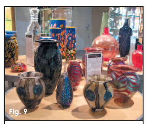
Visit a glass museum, art gallery, or some other craft venue. The ideas that will come from those visits can give you fresh inspiration to apply to your work.