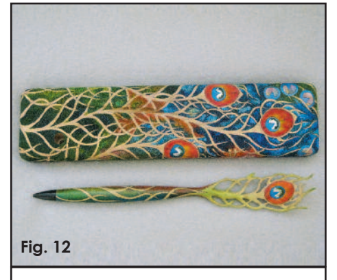
This pen and stand collaboration was done with Binh Pho as a fund-raising donation to the Educational Opportunity Grant program for the AAW in Hartford.