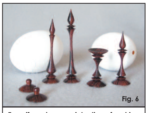
Even if you have no intention of making many pierced eggshell ornaments, can you see where mastering a bit of delicate finial turning will add to your sharpening skills, tool control, and work-holding skills?

Learn to use every tool in your kit. If you always use the spindle gouge, try the skew or parting tool or roughing gouge. I assure you that any of these tools will make just about any pen you wish once you are the master of that tool. Sure, you can get good with just one tool, but doesn't having the skills to use any tool in the box give you newfound skill sets? Experiment with the materials (see Fig. 4 ). "What if" is a great question to ask yourself. From every failure, you should learn something and that knowledge is valuable as your capabilities grow.