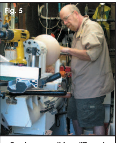
Turning something different will expose you to various techniques and processes.