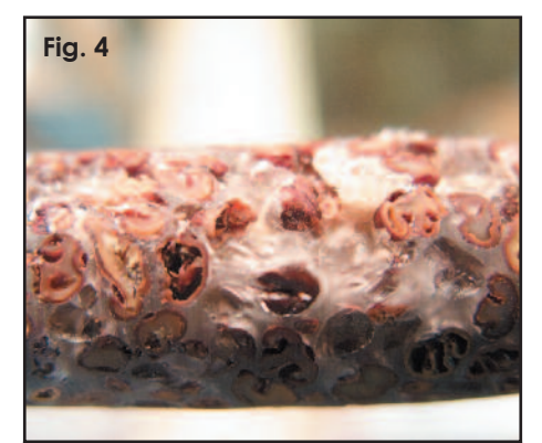
Here is a failed experiment using grape seeds as a filler for polyester resin. The seeds cut well, but are too porous and don't bond extremely well to the resin.