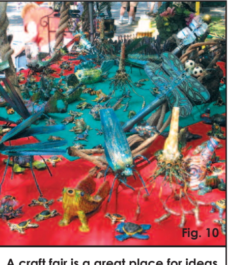
A craft fair is a great place for ideas.

someone you think has achieved a higher level than you? Have you applied to enter a juried show? (I mean a real juried show-not the "mail your check and you're in" kind of setup.) Have you applied to be a member of a juried guild? Getting critical evaluation is a valuable asset to you if you genuinely want to improve your skills. Just be prepared to cope with the criticism if you ask for it.