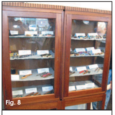
Show your work along with the work of people you admire or aspire to be.