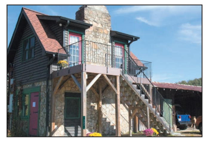
Fig. 10. Scattered around the campus are a variety of buildings that are part of the Folk School's infrastructure. The catalog creation and advertising are done from this scenic building at one end of the campus.