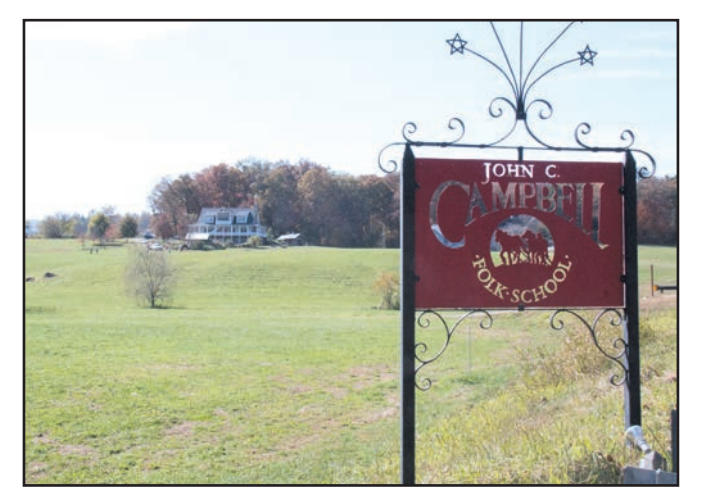
Fig. 2. The John C. Campbell Folk School is situated on 300 acres in a beautiful part of the North Carolina mountains. Though walkable, the extreme ends of the campus are a bit far.