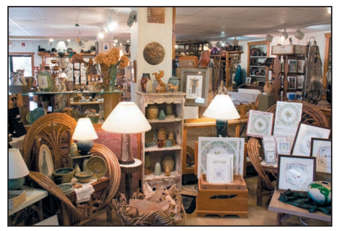
Fig. 17. The craft shop is one of the founding members of the Southern Highlands Craft Guild. It features work from over 300 local and regional artists. Paintings, jewelry, ironwork, glass, books, and more can be found here.

Fig. 16. The blacksmithing studio has just finished a modernization with the old section remaining in the front, and a huge timber frame building is in the back with updated equipment and facilities. Warm by nature, it is one of the places that usually has all the doors wide open during use.