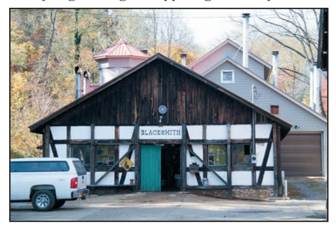
Fig. 16. The blacksmithing studio has just finished a modernization with the old section remaining in the front, and a huge timber frame building is in the back with updated equipment and facilities. Warm by nature, it is one of the places that usually has all the doors wide open during use.