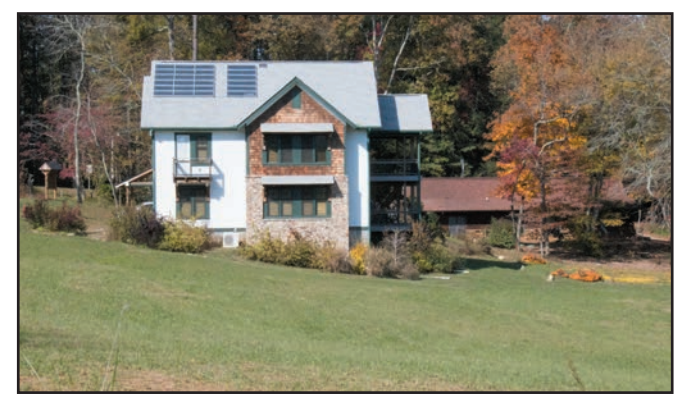
Fig. 15. The property has buildings that range from vintage to modern. These include the studios, support buildings, and student accommodations. The school is extremely environmentally friendly—from conservation to recycling to being self-supporting with many foods.