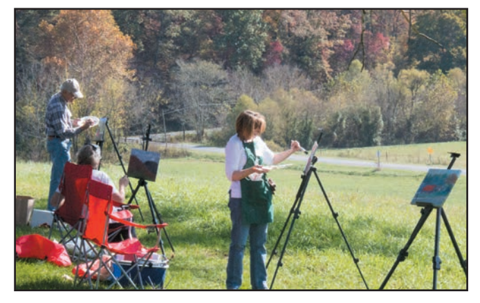
Fig. 8. Many of the class sessions are held outside. The students in the classes for hiking, fishing, painting, and more enjoy the rolling hills and valleys of the local terrain. Here, folks from the painting class are painting the classic red barn located farther down the hill.