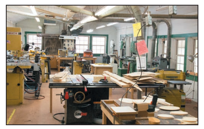
Fig. 7. The rustic outside of the various studios bely the modern equipment and facilities contained inside. All are outfitted with the equipment to support the programs, along with modern dust collection and air conditioning.