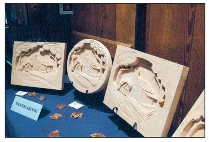
Fig. 12. Whether from the weeklong or weekend classes, the works from the various disciplines are inspiring. Some of the works from the weekend woodcarving class are shown with each student's interpretation of the same subject.