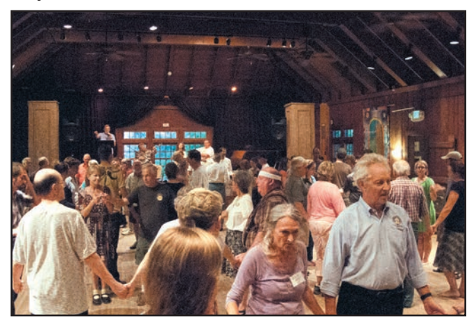
Fig. 13. One of the great aspects of the school is the socialization, including Morningsong, intermixing of class visits, and the concerts and dances. Saturday night dances are gatherings for the students and locals. Don't know how to square dance? They'll teach you.