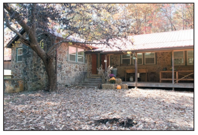
Fig. 6. Many of the studios are in rustic buildings that convey the character of the area and inhabitants from times gone by. The studios are located in different parts of the campus with their own parking areas for those who drive.