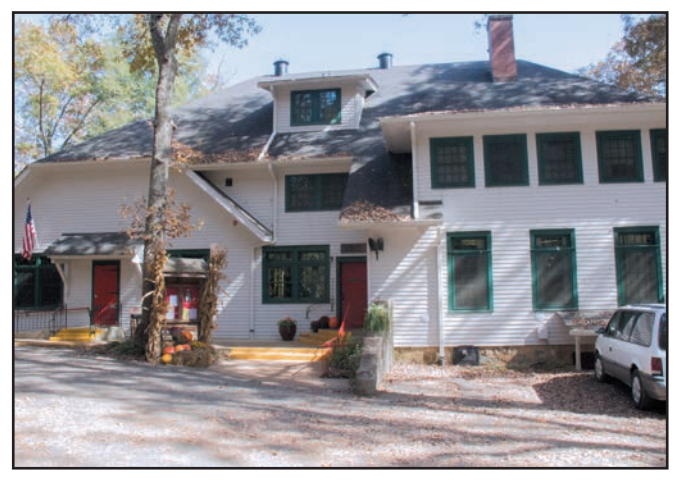
Fig. 3. The hub of everything revolves around the Keith House. It serves as the home for registration, some housing, some studio space, and the meeting hall. Open to all, it has a Wi-Fi hot spot, as well as the best location for some of the spotty coverage for cell phones.