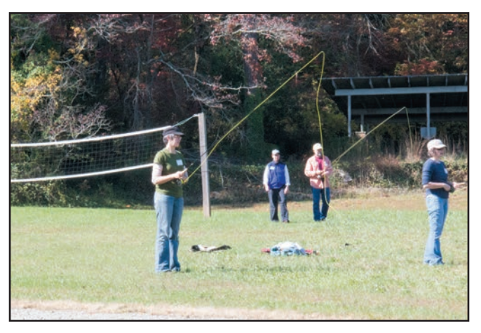
Fig. 9. Among the special classes held at the Folk School is fly-fishing. Not only do the students learn the fundamentals of the equipment and techniques, but they also get fishing licenses and make fishing trips to the local streams.