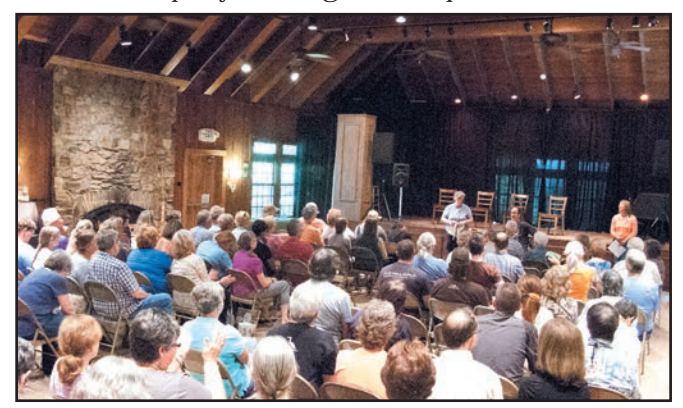
Fig. 4. The meeting hall is used several times a day for Morningsong, group meetings, class graduations, and entertainment. Equipped with a stage, sound system, and folding chairs, it comfortably seats the student, teacher, and staff populations.