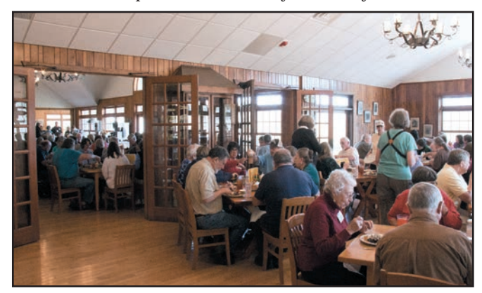
Fig. 14. Another part of the experience is the family-style dining. The school can provide for special needs, as well as providing for the group. Each meal begins with a blessing, followed by an excellent meal (with plenty to go around). Mixing of classes is encouraged.