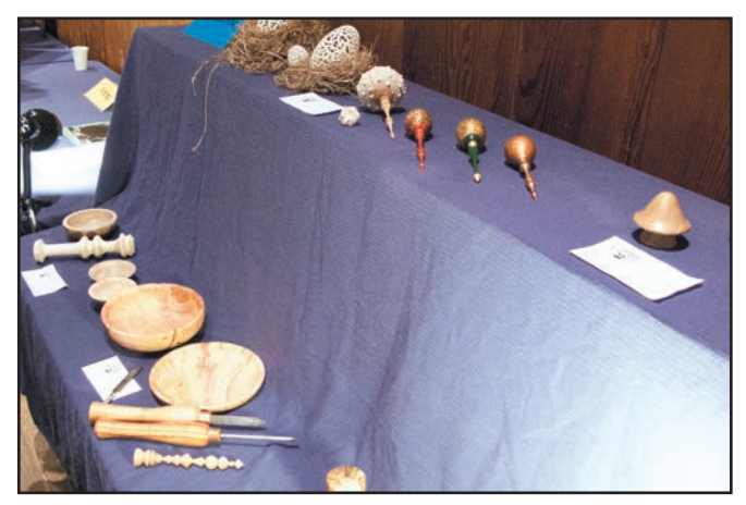
Fig. 11. On "graduation" day, the students from all the various classes gather in the meeting hall to display projects from their class. The students gather to visit the displays from all the groups before the final closing ceremonies.