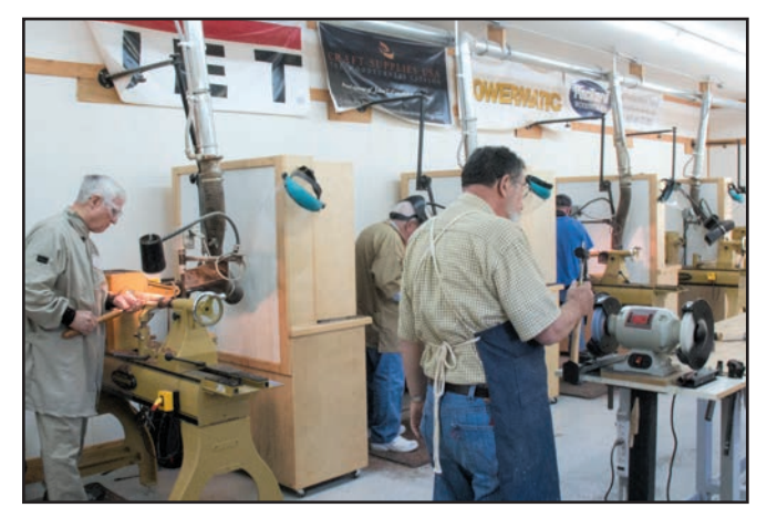
Fig. 5. The Willard C. Baxter Woodturning Studio is equipped with workstations for ten students plus the instructor. The equipment includes eleven Powermatics, eleven mini-Jets on stands, and all the shop support equipment from drill presses to bandsaws and grinders.